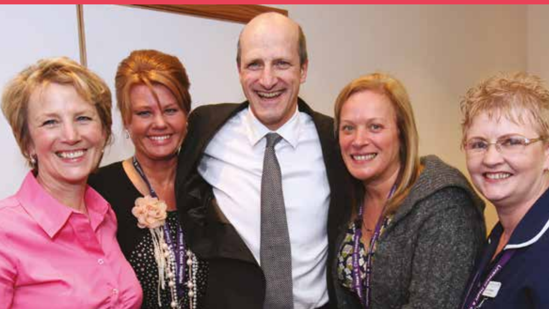
Holly Suite Project team enjoy the official opening

The design of Holly Suite reflects the ideas of consultants, nurses, infection control staff, architects, as well as patients and families who were heavily involved throughout the project.