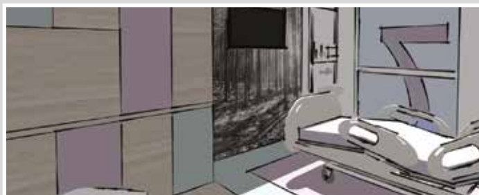
An architect's impression of the rooms for the new CF unit

including physiotherapy, exercise, medication and nutrition."